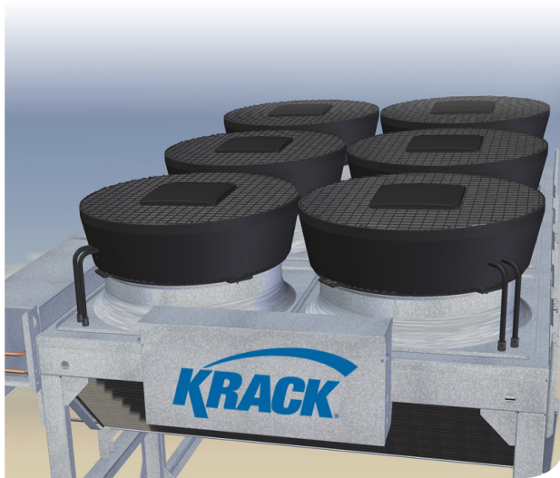
Microchannel EC Condenser

Lower Noise - Greater Energy Efficiency - Easy Installation