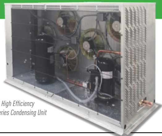
Shown: High Efficiency H-Series Condensing Unit

Learn more about the High Efficiency H-Series product line at www.krack.com .