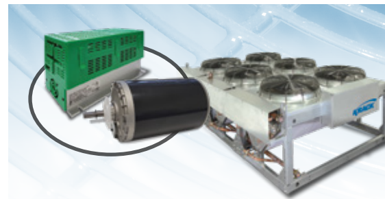
Shown: The NEW Vspeed Variable Speed Motors for Microchannel MXK (also available with Levitor II LAVK)