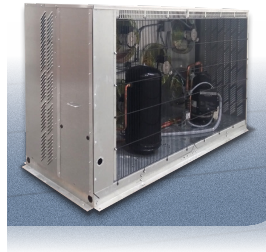
Shown: The NEW High Efficiency H-Series Condensing Unit designed for DOE 2020 applications