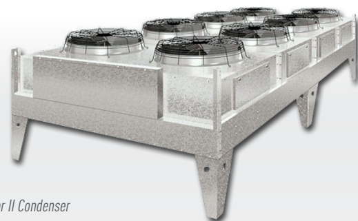
Shown: Levitor II Condenser

For nearly 90 years, Krack, a Hussmann Corporation brand, has been committed to delivering products with design leadership and innovation that provide customer-focused solutions for all your commercial refrigeration needs.