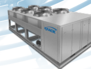
Shown: C-Series Condensing Unit

Options for other refrigeration systems to configure with evaporators and condensers include Parallel racks and Protocol to match any refrigeration need for a centralized or distributed system.