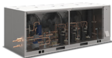
Shown: The NEW Proto-Aire EZ Refrigeration System