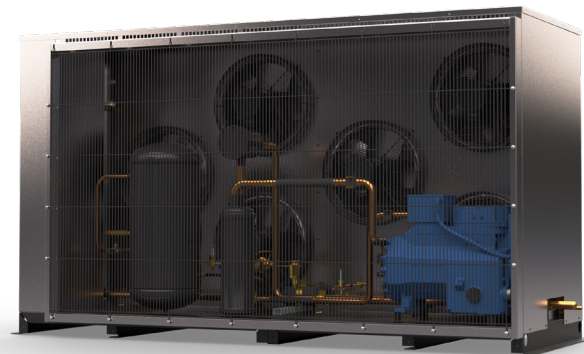
Extra-Large Unit with Standard Frame